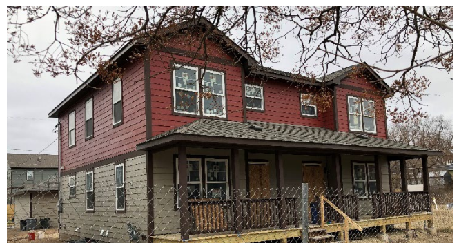
Twinhome built by Holy Hammers volunteers (as of December, 2020)

Holy Hammers started the build of a twinhome for two low-income families at 588 – 590 Wells Street, St. Paul in July. Up to eight volunteers wearing masks worked on the units for 10 weeks. Twin Cities Habitat for Humanity hired contractors to install the siding on the structure and hang the sheetrock inside – two tasks usually completed by volunteers. The garage is now finished. The staff anticipates they can have families in the home by July 2021.